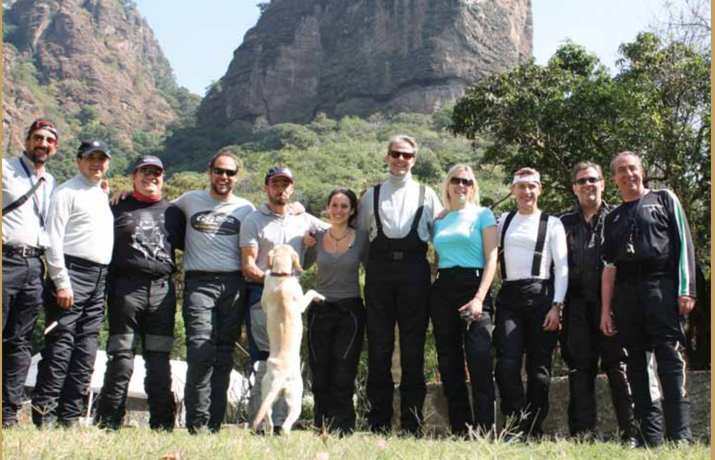
Crew and friends with "Squash" in Tepoztlan Morelos.