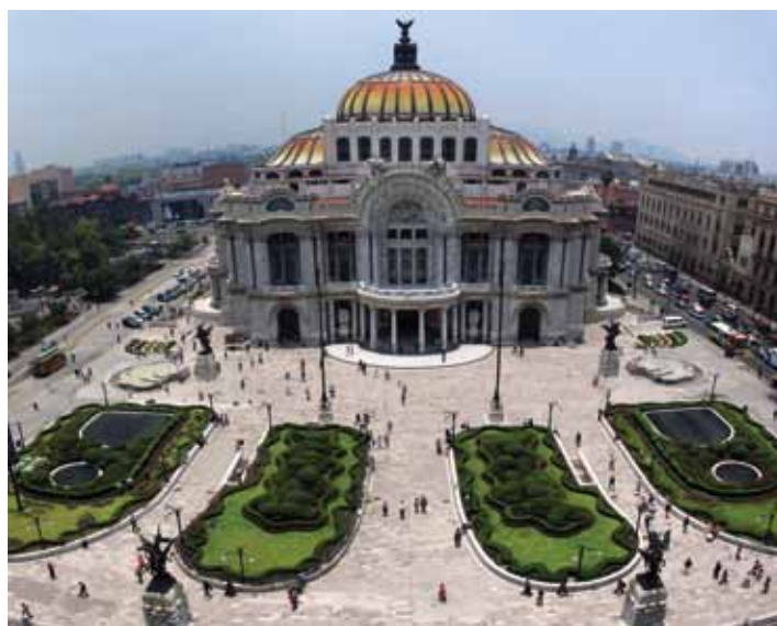
Right: Palacio de Bellas Artes